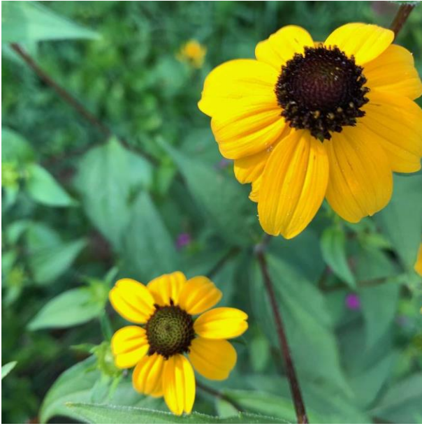
A flower, or a picture of a flower