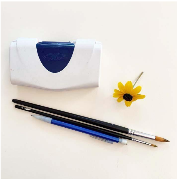
Brushes, Watercolors and a pencil